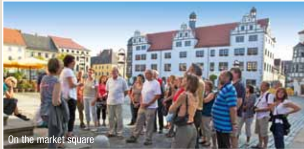
On the market square