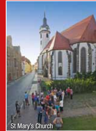
St Mary's Church

A version of the Bible is being copied by hand by visitors in the Luther Room of the superintendent's building.