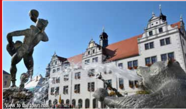
View to the town hall