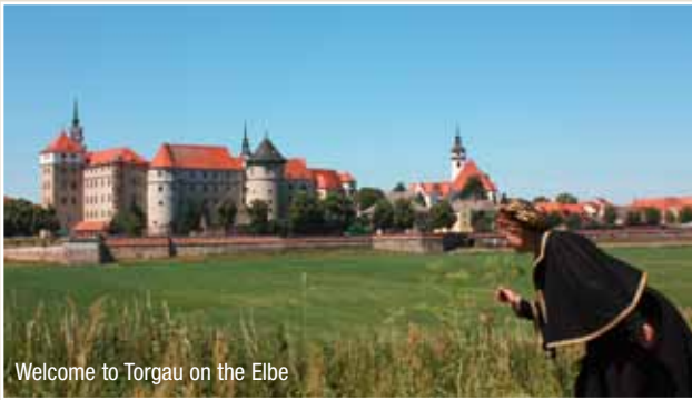
Welcome to Torgau on the Elbe

A visit to Torgau will never be boring. You can find souvenirs, postcards, literature and personalized advice in our tourist information center in the city hall.