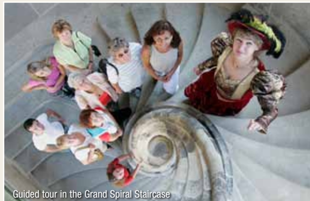
Guided tour in the Grand Spiral Staircase

Hartenfels Castle had been regarded as the most modern residential palace in Saxony for many years and, even after the residence of the prince-electors was relocated to Dresden, large festivals and assemblies of the Saxon state parliament were still held in the castle. The castle, the city hall and many splendid patrician houses make Torgau one of the most beautiful Renaissance cities in Germany.