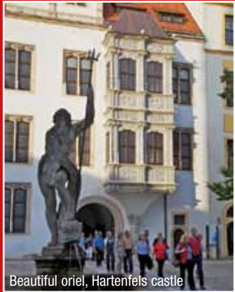
Beautiful Oriel, Hartenfels castle

For over 80 years, Villeroy and Boch, manufacturers of fine porcelain, have had a factory in Torgau. Goods from the factory are for sale in the factory outlet center.