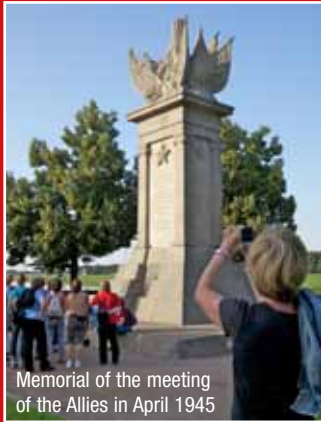
Memorial of the meeting of the Allies in April 1945